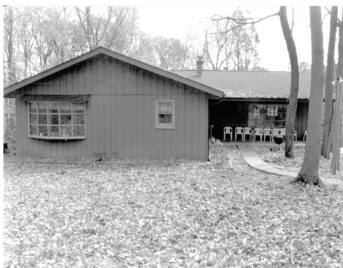
Hite House was opened in 1996